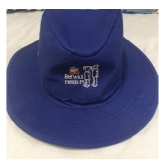
Blue Hat Compulsory from 1 September till 30 April