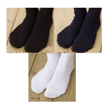
Socks – White, Black, Navy