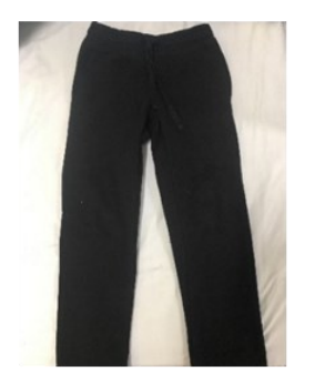
Black Pants No Jeans