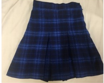
Winter Skirt (Tunic)