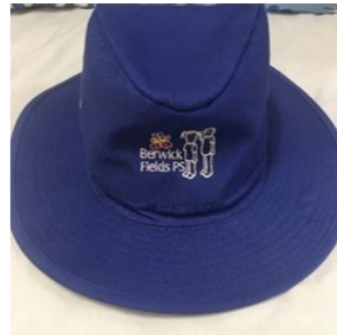
Blue Hat Compulsory from 1 September till 30 April